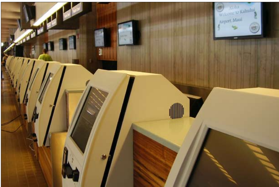
New passenger check-in counter spaces with computerized kiosks, new baggage claim carousels, and a new generator building to provide additional back-up power in the event of an emergency, were installed at the Kahului Airport in May 2007. These improvements will help to make air travel more efficient for passengers.