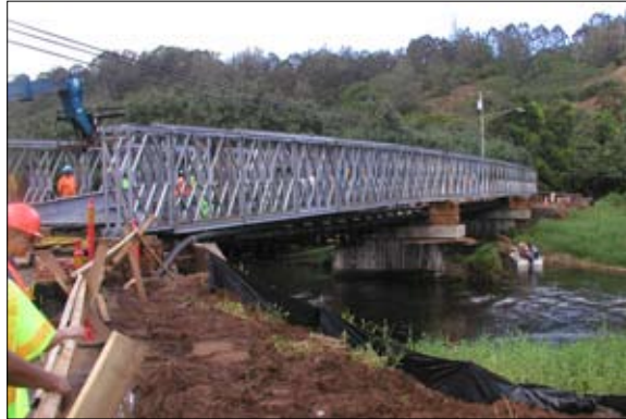
Temporary bridge structures were constructed across Kauai's Wainiha Stream to restore access to the north shore communities of Haena and Wainiha in 2007. DOT continues to work with the community to ensure that the aesthetic look of the original bridges is maintained in the new designs.

On Molokai, guardrail and shoulder improvements for Kamehameha V Highway from Kapuokolau to Kamalo were bid. The replacement of Kawela Bridge on Kamehameha V Highway is being proposed due to hydraulic inadequacies and non-conformance to current