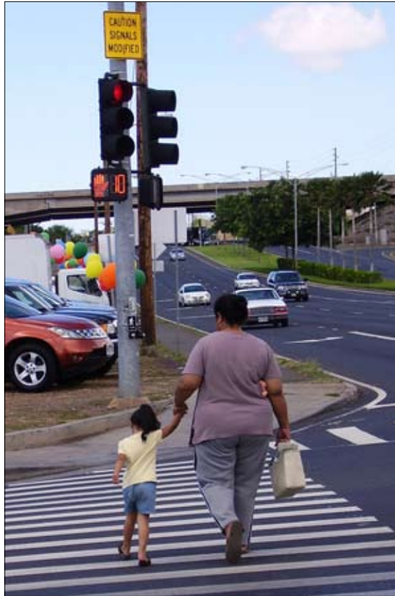
Pedestrian safety measures were installed on Farrington Highway through Waipahu, including sixty-eight new countdown-timer crosswalk signals and median divider landscaping and fencing to deter jaywalking.

The Walk Wise Hawaii (WWH) program continued its work in FY 2007 to improve pedestrian safety across our state. The program, a