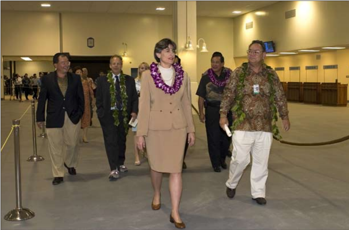
Governor Linda Lingle tours the newly dedicated Pier 2 cruise ship terminal at Honolulu Harbor in February 2007. The terminal is capable of accommodating the largest, "state of the art" cruise ships currently in service worldwide.

harbor capacity there is a major joint Federal/ State planning project underway to study the feasibility of deepening Kalaelea Barbers Point Harbor. This project will include the deepening of the turning basin and widening and deepening the entrance channel to the harbor.