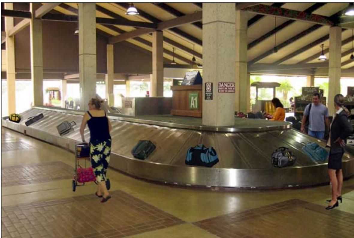
Artists' rendition of upgraded baggage claim area at the Lihue Airport. Four baggage carousels will be replaced by larger and longer carousels capable of accommodating overseas passenger baggage. This $5.1 million project opened for bids in August 2007.