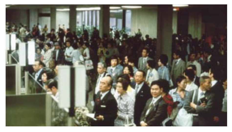
Top: Concessions offered a variety of merchandise to travelers. Above: International travelers await immigration clearance.

Foundation and utility work for the Interisland Terminal's Central Building was underway and should be completed in October 1990. Work on the Central Building itself was expected to begin the following month and be completed in August 1992.