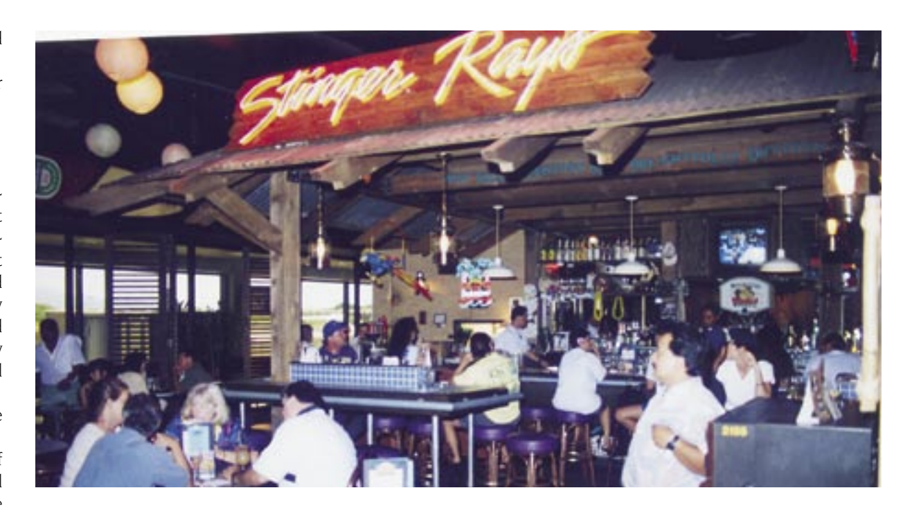
Above: Stinger Rays is a popular eating place in the Interisland Terminal.

March 1996 A contract was awarded to renovate the 4th and 5th floor offices of Oahu District Office, $800,000. Completed October 1997.