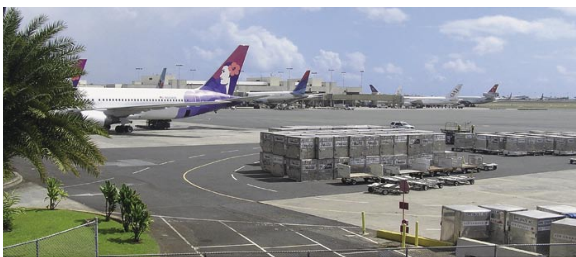
Below: Cargo containers await loading.

Two major private projects were constructed. The 85,000-square-foot Continental Airlines Heavy Maintenance Facility was dedicated on July 3, 1998. It allows maintenance of large aircraft locally in lieu of sending them to the mainland.