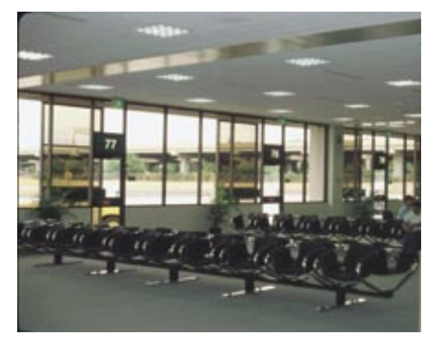
Top: 1988 Commuter Terminal cafe. Above: 1988 Commuter Terminal waiting area.